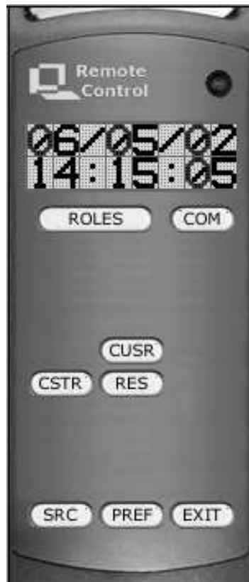
Figure 2: Author Remote Control